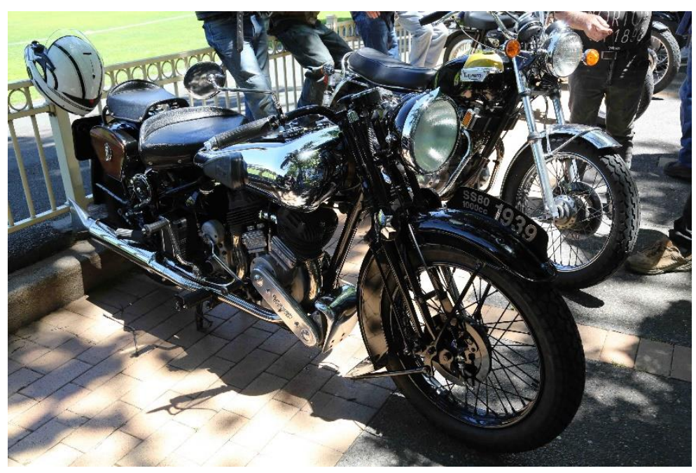
The very superior Brough Superior

About 230 cars, 30 motorcycles and one tractor, were on display around stunning Queanbeyan Park, later in the afternoon a cricket game kicked off in Brad Haddon Oval, again very British Sunday indeed.