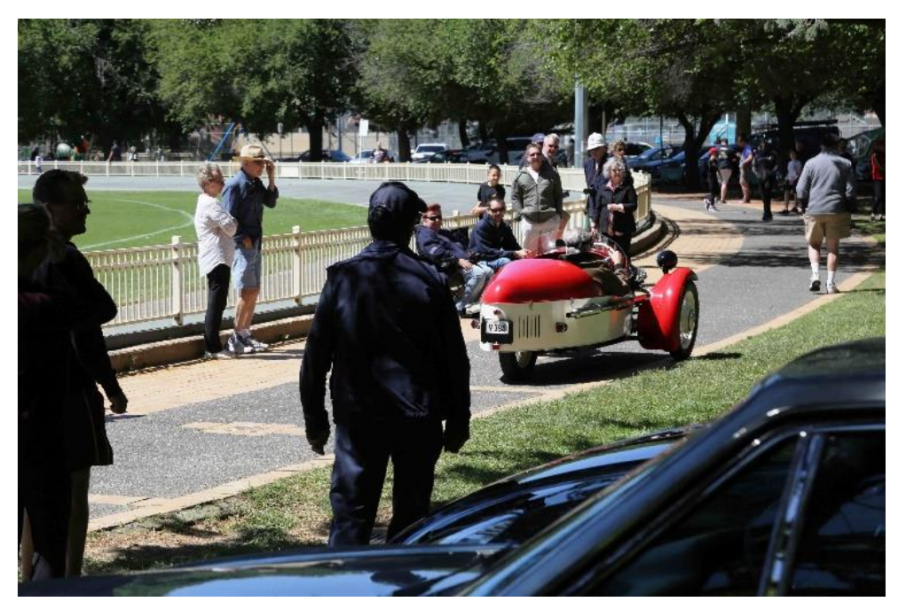
The very popular Morgan 3 wheeler doing a lap round the oval

The best of British vehicles arrived from the Sapphire coast, Southern Highlands, Bathurst & Orange, Cooma, Sydney, Wagga Wagga, Riverina, South Coast, Hunter Valley and the wider Canberra Region.