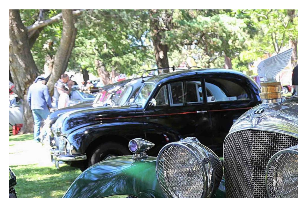
The Morris Minor low light & the Nose of the Big Bentley

The 45<sup>th</sup> Terribly British Day, held in the Queanbeyan Park, was again a huge success, with a large crowd enjoying the first car and bike show to held since the Covid 19 virus interrupted our lives.