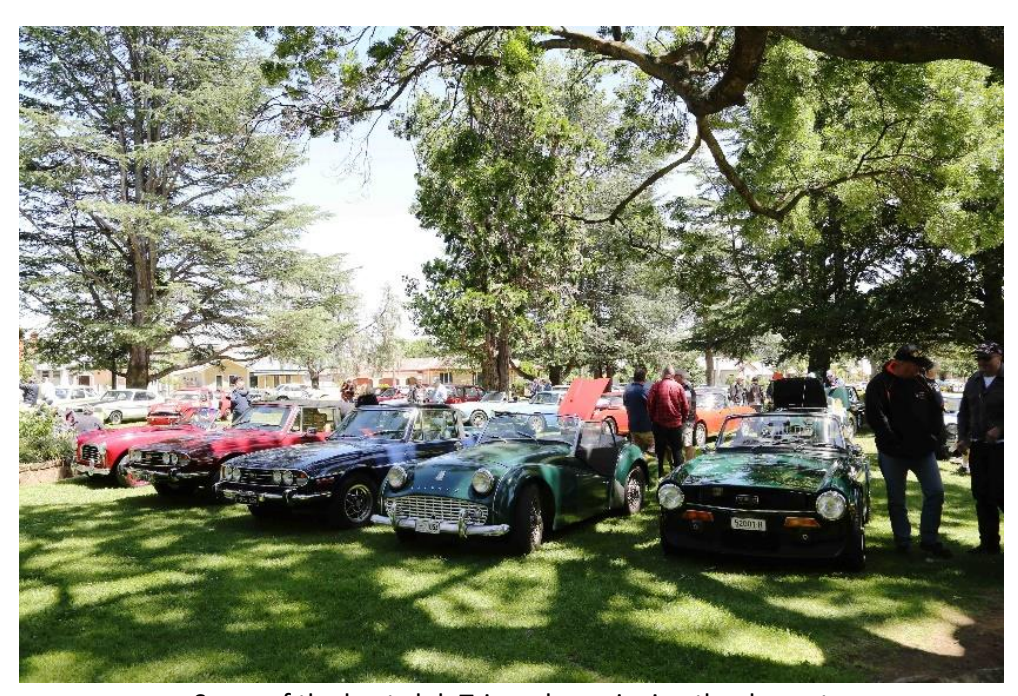
Some of the host club Triumphs, enjoying the day out

Club of the day: ACT MG club won that title with a very good display of old and new vehicles. Selected by the team of the charity of the day, Respite Care for Queanbeyan.